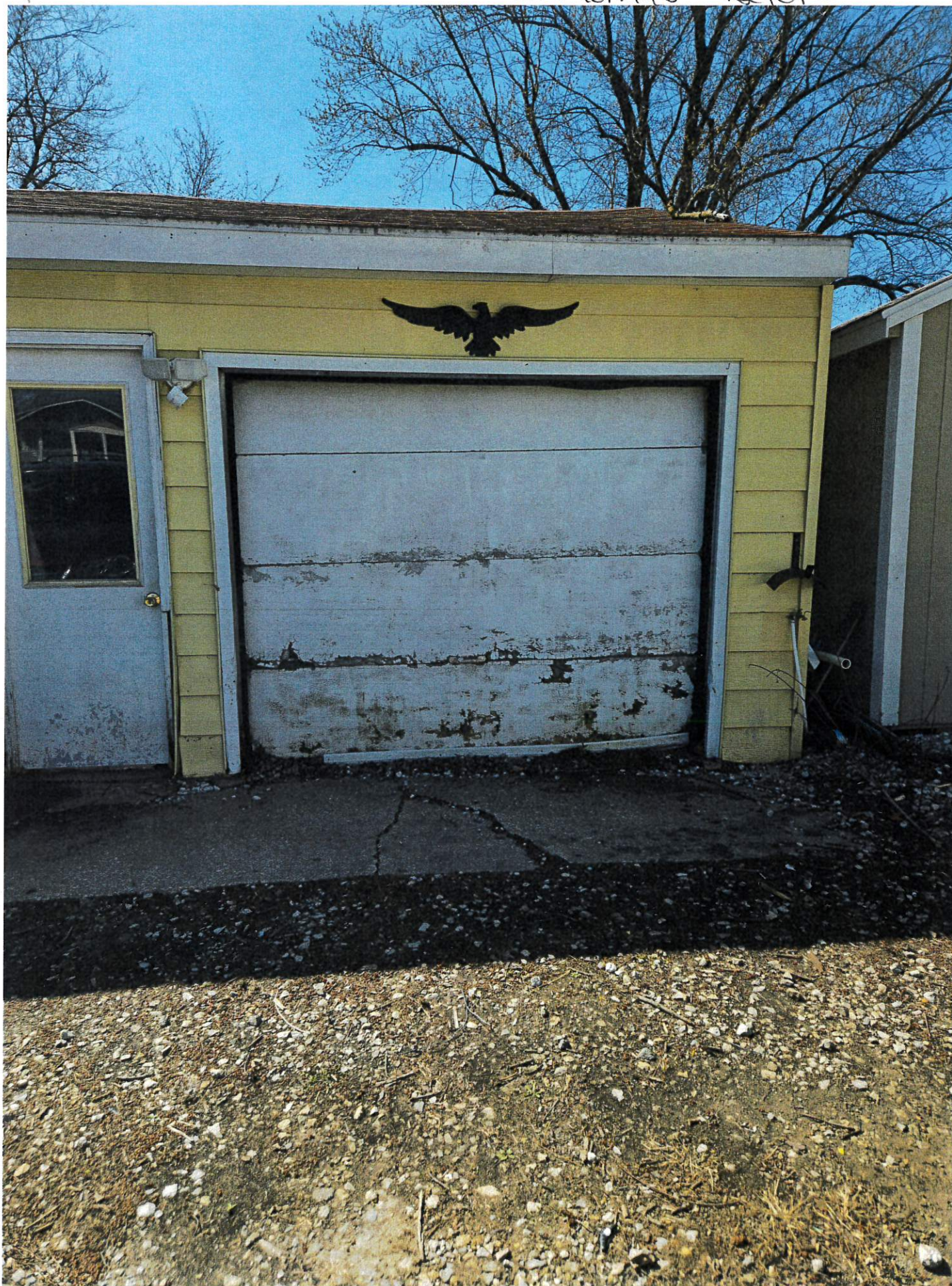
C. Thomas - Before